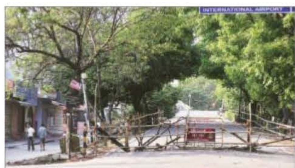
A makeshift barricade blocks the entry to a containment area during the lockdown in Bengaluru

The insolvency and bankruptcy code (IBC) stipulates that the resolution process of a stressed company will have to be completed in a maximum of 270 days. Accordingly, various processes are to be completed within specified time frames. The amendment to the resolution regulation would come into force retrospectively from March 29, while that to the liquidation regulation would take effect from April 17. The Insolvency and Bankruptcy Board of India (IBBI) has clarified that