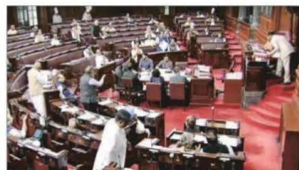
A file photo of a Rajya Sabha session

The deliberative functions of the RS include taking up issues of public importance and concerns under various instruments like discussion on the motion of thanks to the President's address, general discussion on the budgets, short duration discussions, zero hour and