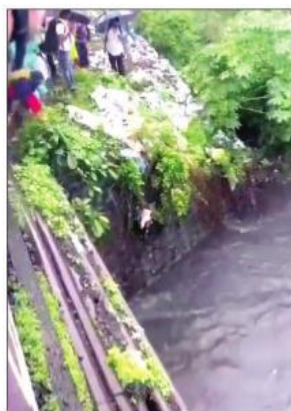
पत्रीपुलाजवळील रेल्वे मार्गाजवळील नाला.

मुसळधार पावसामुळे रेल्वे वाहतूक बुधवार सकाळपासून विस्कळीत झाली होती. कल्याण ते डोंबिवली रेल्वे स्थानकांच्या दरम्यान दुपारी कर्जत, कसाराकडे जाणाऱ्या लोकल पाठोपाठ थांबल्या होत्या. त्यामुळे अनेक प्रवासी लोकलमधून उतरून पायी कल्याण स्थानकाकडे जाऊ लागले. एक महिला आणि तिच्या नातेवाईकही बाळसह लोकलमधून उतरून कल्याण स्थानकात पायी निघाले. ते बाळाला घेऊन पत्रीपुलाजवळ आले. त्यावेळी महिलेसोबत असलेल्या तिच्या नातेवाईकाच्या हातून बाळ निसटून नाल्यात पडले. रेल्वे मार्गावरून जाणाऱ्या काही प्रवाशांनी तातडीने नाल्याच्या कडेला शोध घेण्यास सुरुवात केली.