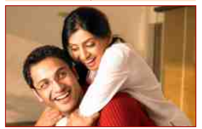
* For applicable charges refer overleaf